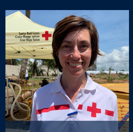
What can CVA for WASH Outcomes look like?