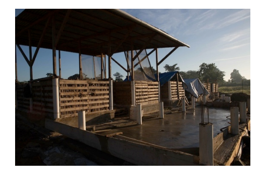
Photograph 3. SOIL compost site in Portau-Prince, Dec 2012.