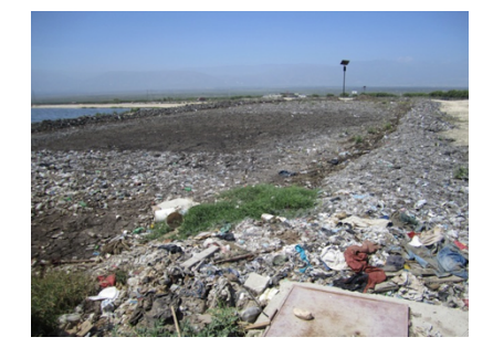
Photograph 2. DINEPA waste stabilization ponds at Morne a Cabrit, Sept 2012

Photograph 1. Uncontrolled waste disposal, Port-au-Prince dump, Aug 2010.