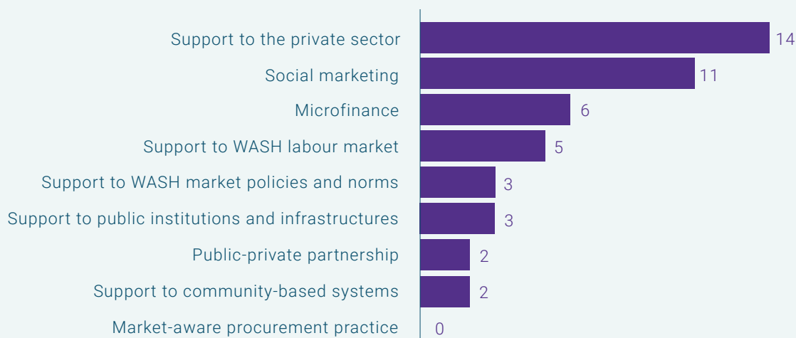
Figure 3. Market support for sanitation practices; number per type of implementation modality

and (4) MBP throughout the humanitarian programme cycle , which presents the use of MBP during sanitation-related assessment, response analyse and monitoring processes.