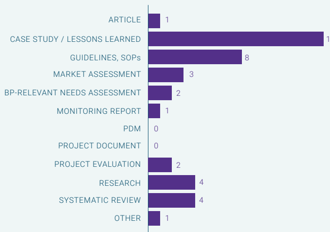
Figure 1. Market support for sanitation; number of practices per type of document