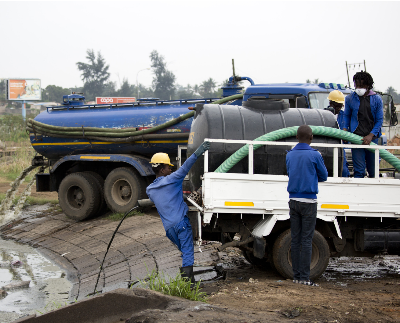
Workers from the community-based organization ACADEC contracted by Water and Sanitation for the Urban Poor (WSUP) discard sewage from a tank on their truck into the Infulene waste water treatment plant in Maputo, Mozambique.