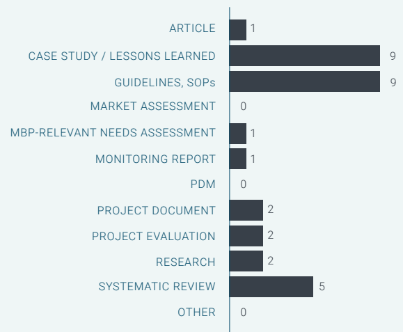
Figure 2. CVA for sanitation; number of practices per type of document

Notes: PDM, post-distribution monitoring; SOPs, standard operating procedures.