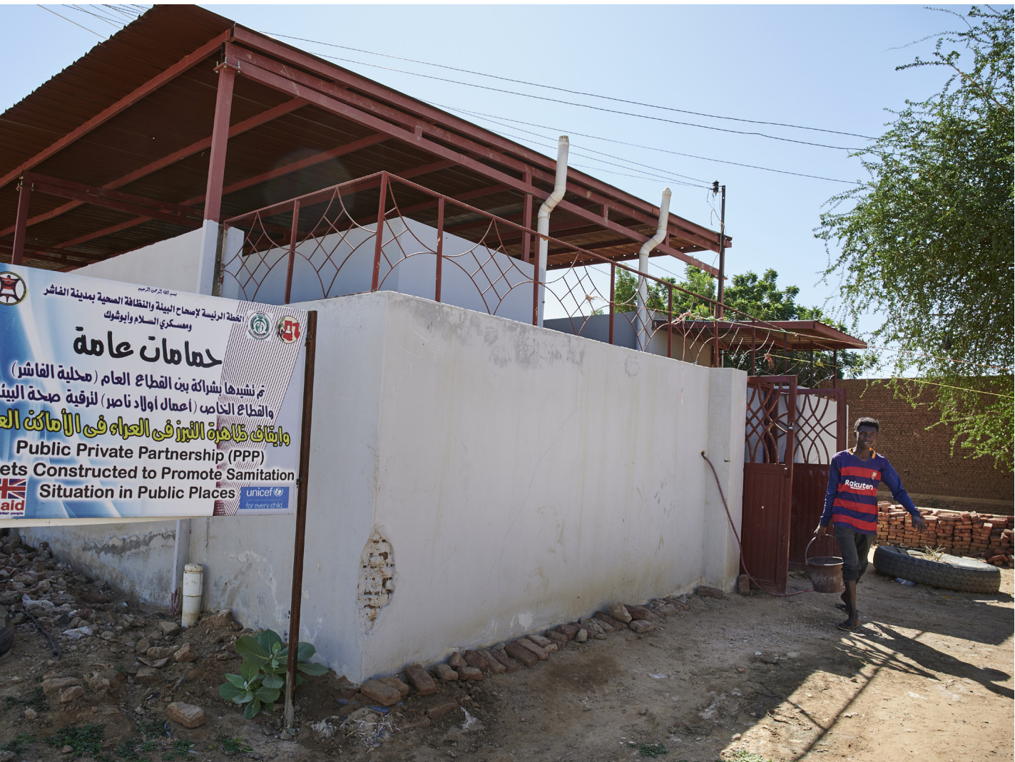
Public–private partnership toilet facility constructed to promote sanitation in the city of El-Fasher, the capital of the state of North Darfur, Sudan.

During the COVID-19 outbreak, many water and sanitation utilities have been providing three months of free services, which has meant a complete lack of revenue during that period (WaterAid, 2020). At the time of writing this report, UNICEF is exploring various ways of supporting these utilities to ensure continuity of service – e.g., by providing financial support to governments, which would then redistribute the funds either directly to public utilities (to support supply) or to vulnerable households through CVA (to support demand). This approach is under discussion and has not yet been implemented (Hutton, 2020).