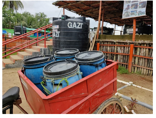
Transportation with barrel and Van